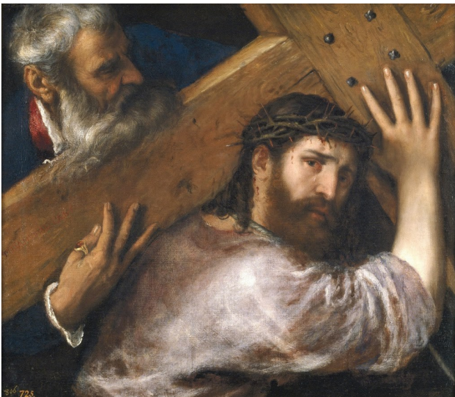
The Carrying of the Cross