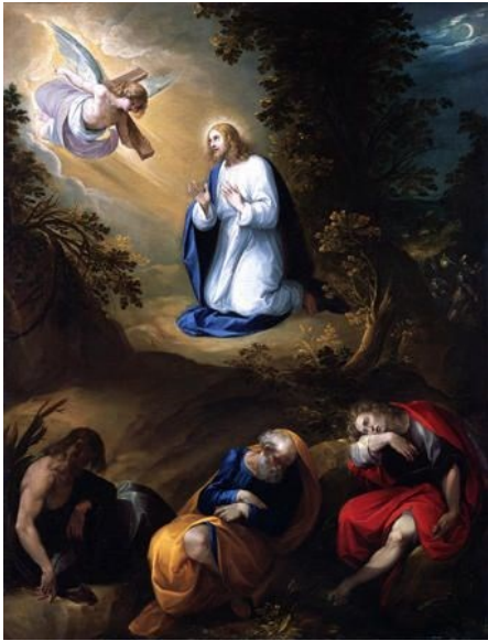
The Agony in the Garden