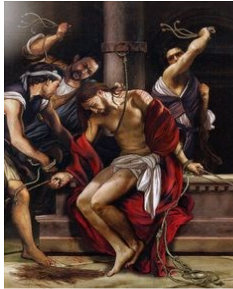
The Scourging at the Pillar